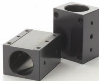
MOUNTING BLOCKS S8006P02 – 0.25" I.D.