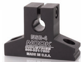
END MOUNTS S8006E01 – 0.25" Diameter