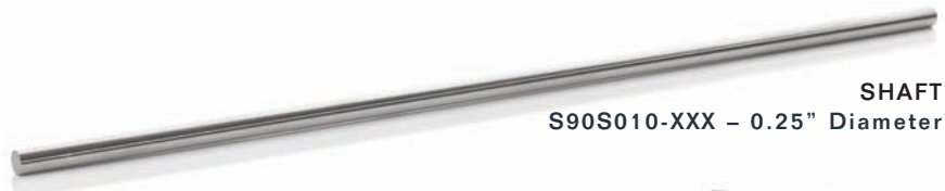
SHAFT S90S010-XXX – 0.25" Diameter