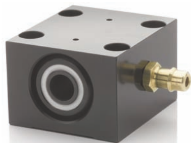
AIR FITTINGS All M3 Thread Size Air Fittings